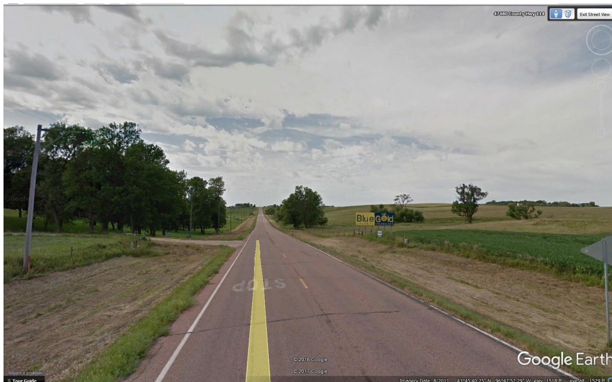
Photo: Google Earth Street View image of the former sign and location.